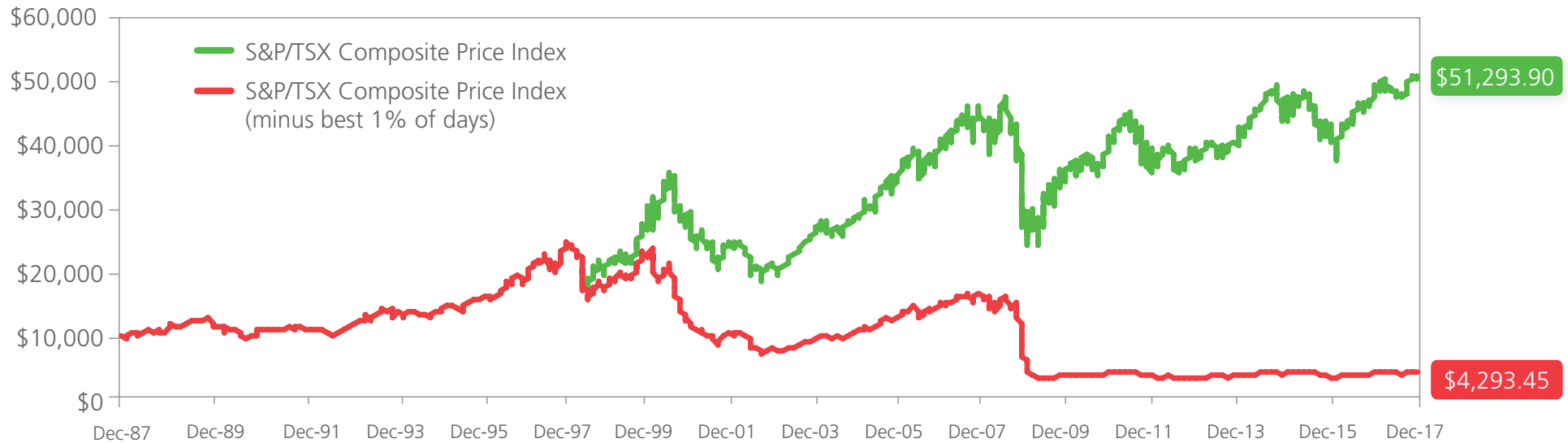
Growth of $10,000 - December 31, 1987 to December 29, 2017

Trying to time the market may cause an investor to miss out on long-term growth. Let's take a look at the impact of missing the best one percent of days over 30 years while investing $10,000 in the S&P/TSX Composite Price Index ("TSX").